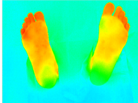
High resolution thermal image of healthy feet

1:00pm Friday 6th October 2017 A17 Pope Building All Welcome